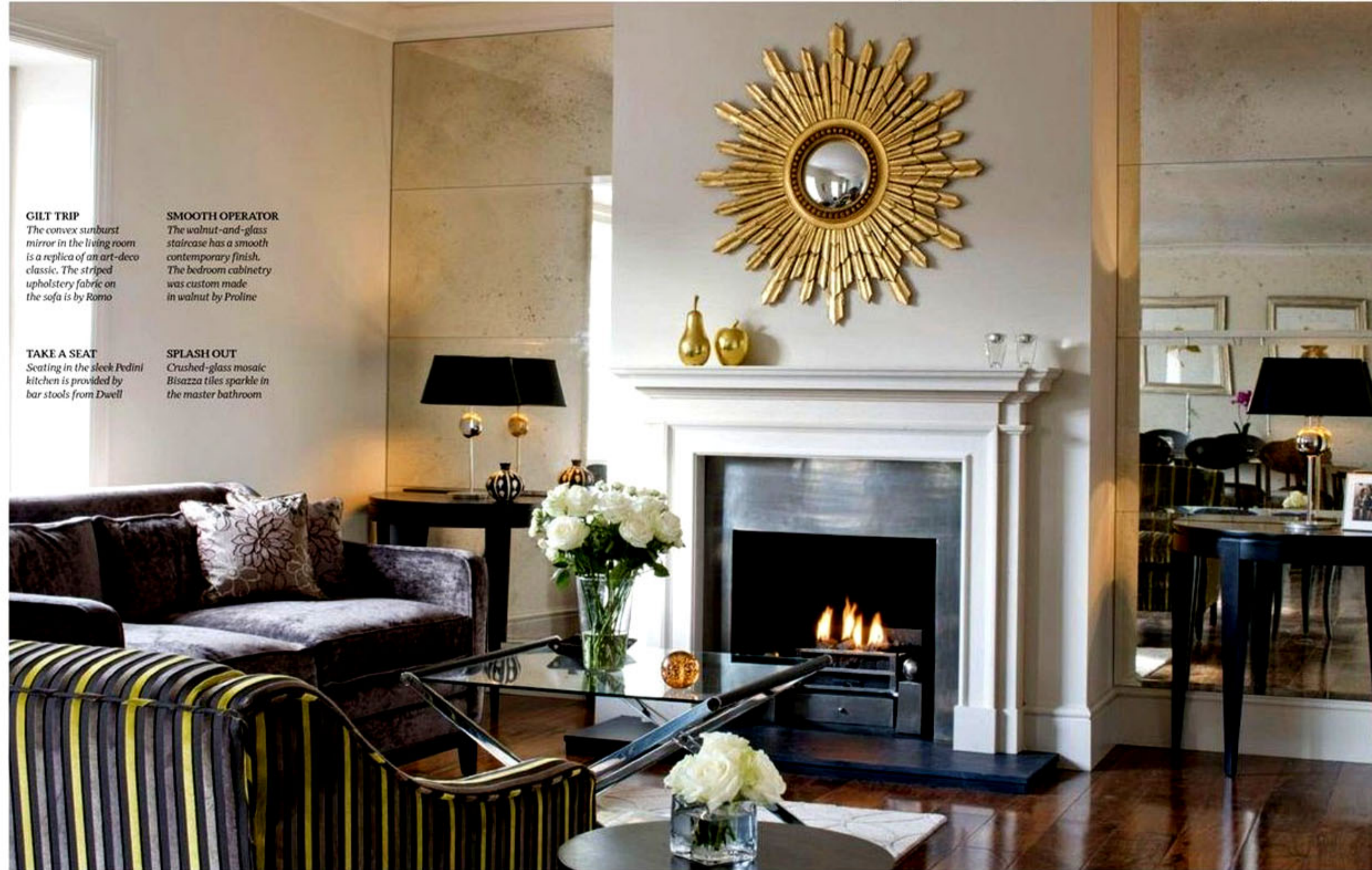
GILT TRIP The convex sunburst mirror in the living room is a replica of an art-deco classic. The striped upholstery fabric on the sofa is by Romo